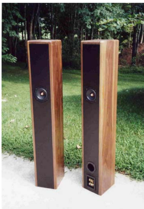
Figure 1. Finished Bipolar ML-TL Speakers with front and rear views.

In his posting Greg details several possible designs for bipole speakers using the FR125S. But the most attractive implementation is the 45 Hz F3 bass response ML-TL which had the smoothest simulation (+/- 1 dB). This design (internal dimensions) calls for a line (or pipe) length of 39.56 inches, a cross-section area of 43.68 squared inches, and a bottom vent diameter and length of 3 inches for both. The driver is spaced 14 inches down from the top. Greg recommends that the stuffing density of 0.3 pounds per cubic foot be distributed 30 inches from the top of the box. He suggests that either use a short stand or a cavity below the speaker enclosure to raise the driver closer to ear height.